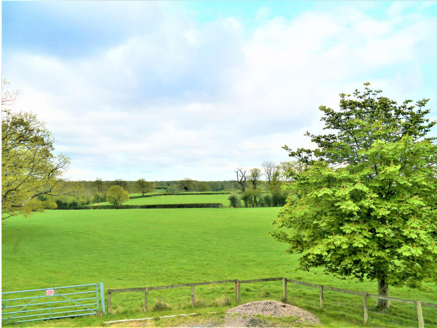
The Red House Grooms Flat Bucks Green, West Sussex